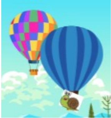
hot air balloon