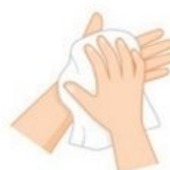
Dry hands thoroughly with towel