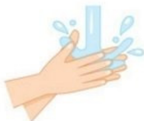
Wet hands with water