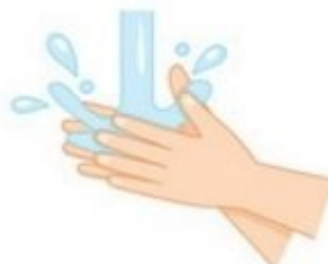
Rinse hands with water