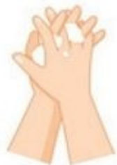
Palm to palm fingers interlaced