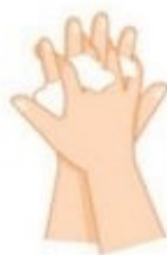
Back of hands