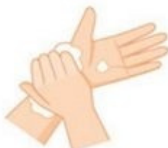
Rotationally rub wrists