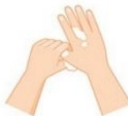
Base of thumbs