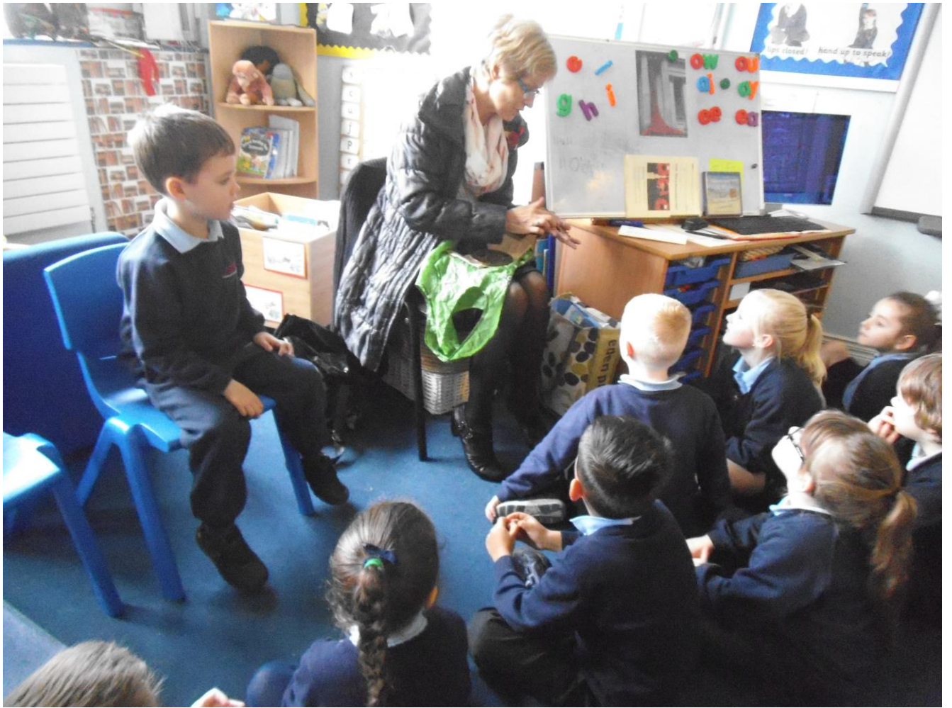
The children enjoyed listening to a guest speaker who showed medals from World War One.