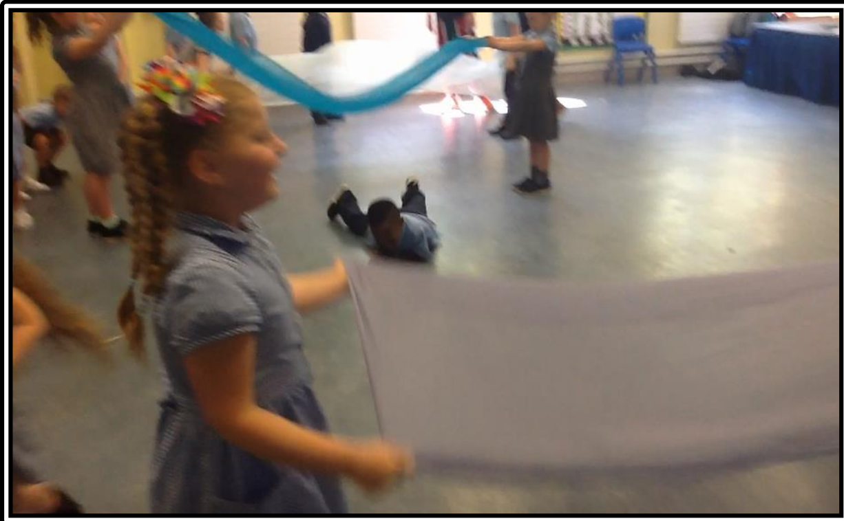
A journey under the sea to Africa!